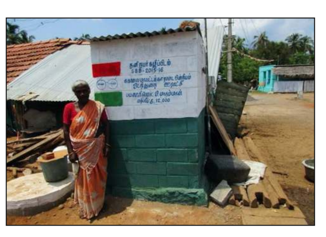
4) A Public Toilet in Odanthurai