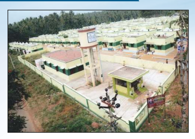
1) Green House Scheme (Construction & Hand Over of 850 Houses Under the scheme "Green House")