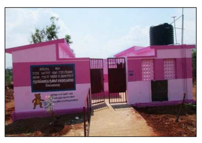
3) School (Set Up of local school which provides primary & secondary education, so that the children don't have to travel 4 km to other villages for education)