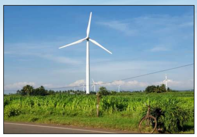
2) Windmill (Built by taking loan of Rs 1.15 Crore from nationalized bank under the Remuneration Enterprise Scheme & contribution of villagers of Rs 35 lakh)